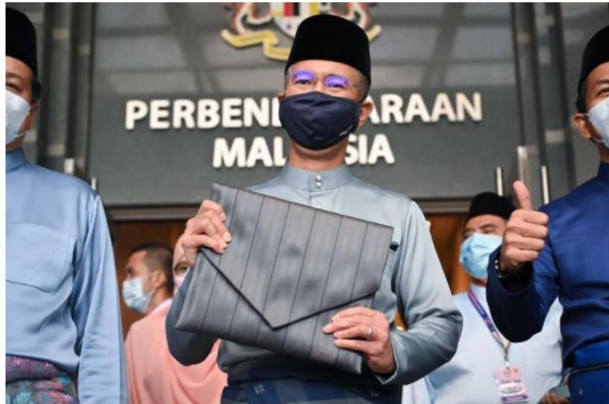
Belanjawan 2021 dibentangkan di Parlimen pada Jumaat petang.

Main points of Finance Minister Tengku Datuk Seri Zafrul Abdul Aziz's Budget 2021 speech